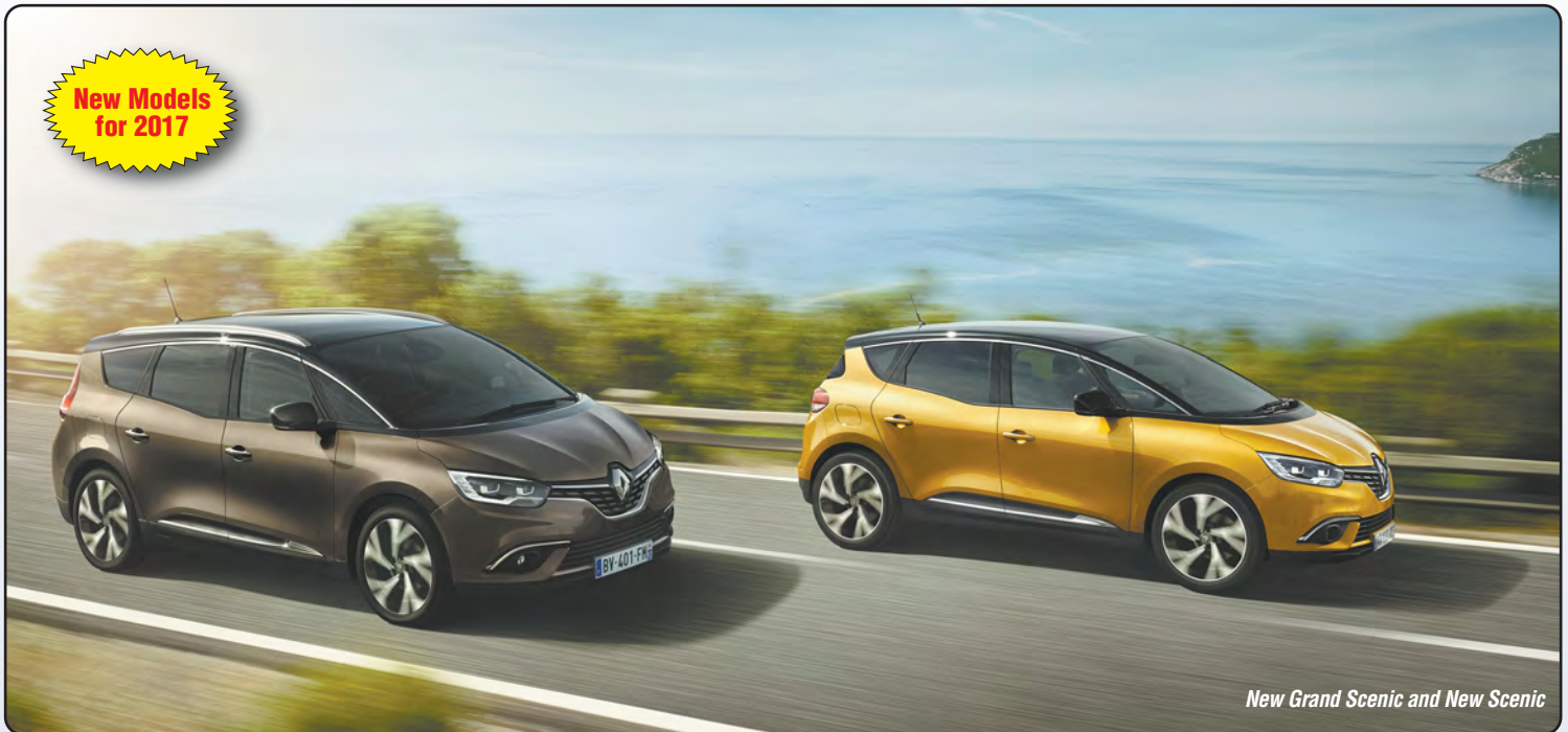
New Grand Scenic and New Scenic

2017 Advance Purchase Special RENAULT EURODRIVE