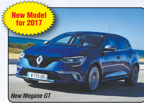
New Megane GT