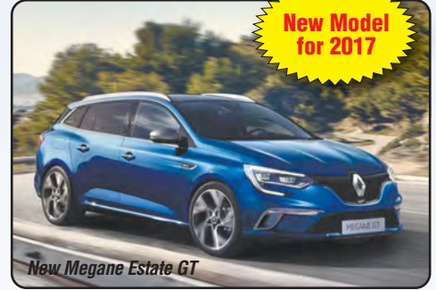
New Megane Estate GT